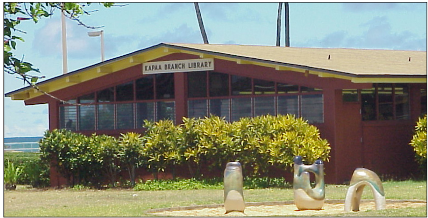
Kapaa Public Library

Kapaa Public Library evokes a “small-town” atmosphere. The