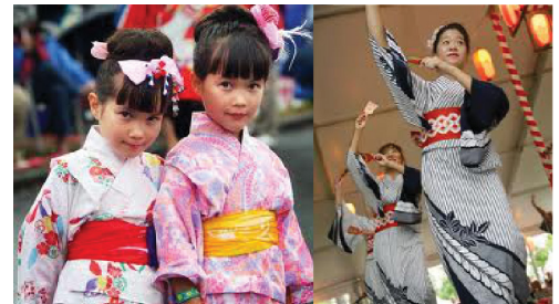
See Super Hero Bon Dance Kicks off Summer Reading, page 3