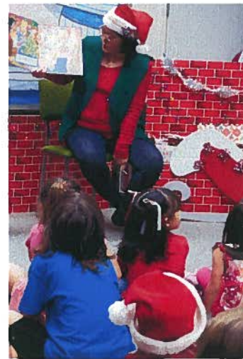
Story time with Mrs. Claus

We have also had preschool story times, school visits, Summer Reading programs, and after school craft programs at the library throughout the year. This year we also tried out having an informal Winter Reading Program. With mostly word-of-mouth publicity, 24 children read 65 books and 7 adults read 9 books during the last two weeks in December. Those who participated appreciated receiving a little incentive for their efforts.