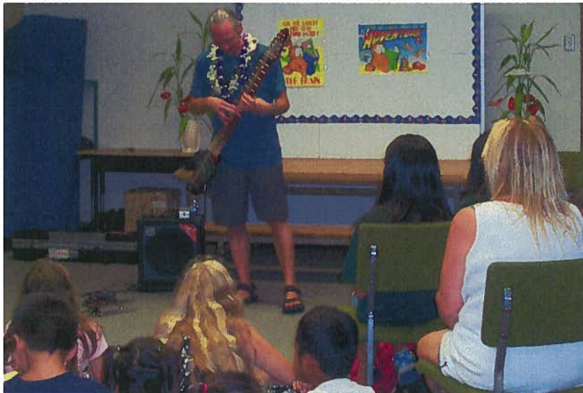
Pat Braden Program: People and Ice

Thanks to the generous support of the Friends of the Library of Hawaii, the Statewide Cultural Extension Program and the many businesses and organizations that have come through for the library, we have been able to present various educational & recreational programs for all ages. Some recent ones include: